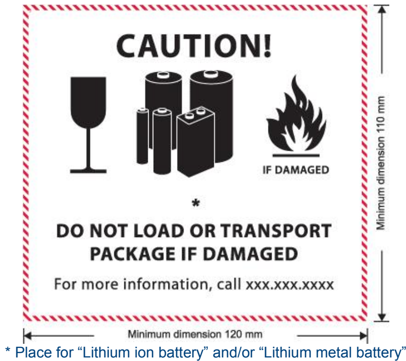
Figure 2 – Lithium Battery Handling Label

Where the packages are of dimensions such that they cannot bear the full size lithium battery mark, the mark dimensions may be reduced to 105 mm wide x 74 mm high. The design specifications otherwise remain the same.